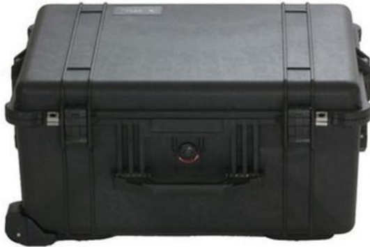
Pelicase shipping case large model