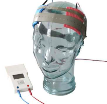
example of use

If you plan to use the DC-STIMULATOR MOBILE in double-blinded studies, please contact the producer for further information.