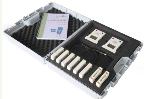
basic set of devices